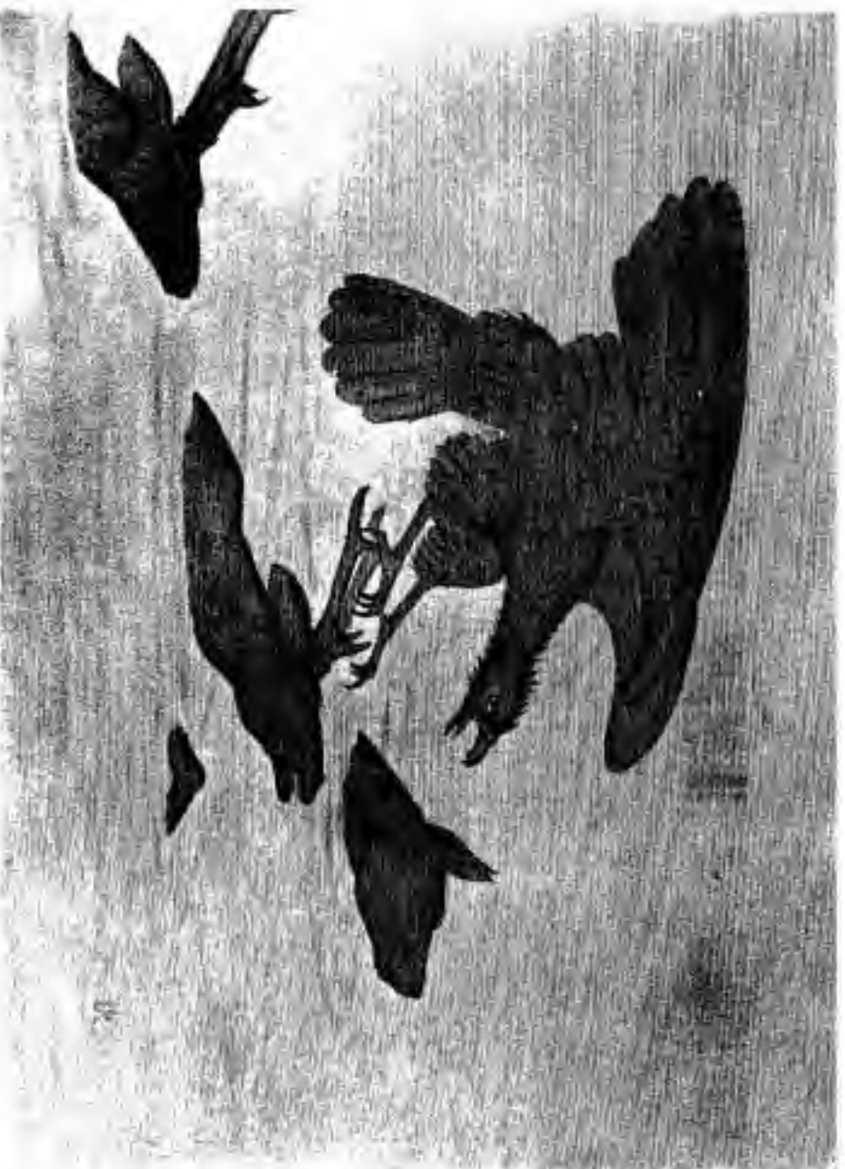
“The kite plucked out one of the eyes of the foremost dove.”